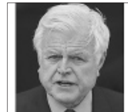
PAGE 5 DEATHS OF MANY MEMORABLE CELEBRITIES.

PLACENTIA'S OLDEST CONTINUOUSLY RUNNING NEWSPAPER, EL TIGRE IS A STUDENT-RUN NEWSPAPER IN THE PLACENTIA-YORBA LINDA UNIFIED SCHOOL DISTRICT