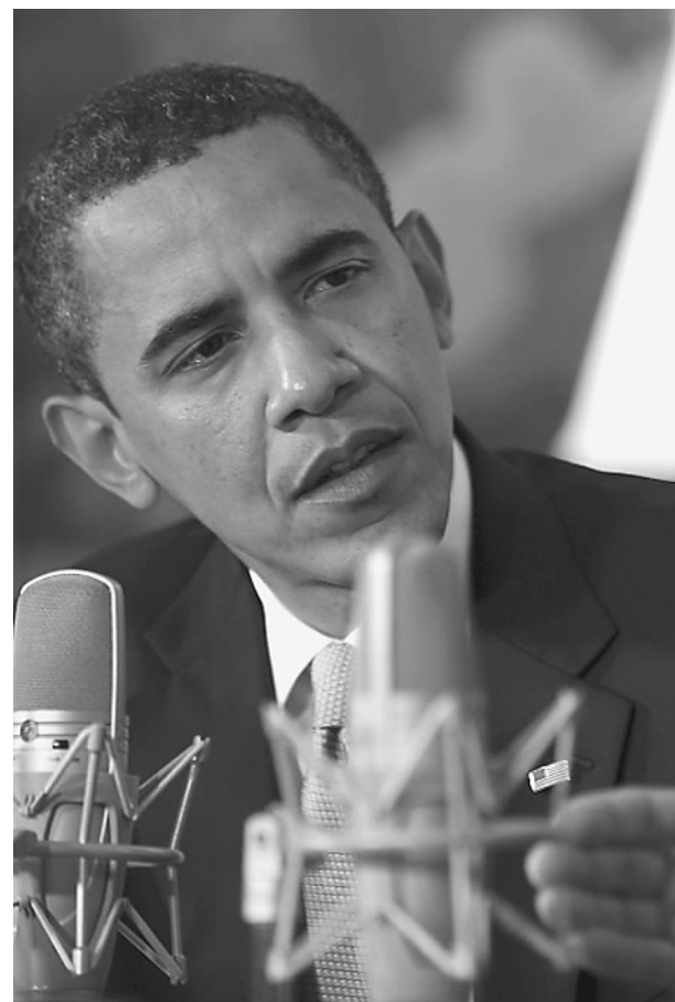
PRESIDENT OBAMA DISCUSSES HIS HEALTH CARE PLAN DURING A TOWN HALL MEETING IN NEW HAMPSHIRE.

How long will it take before the bill will start aiding us? The public health insurance plan will go into effect in 2013 and by that time, we will all be changed by it. President Obama is sure that the Health Care Reform will help the population when it becomes a reality in four years time, in the mean time it will face fierce debate from both sides of this heated battle.